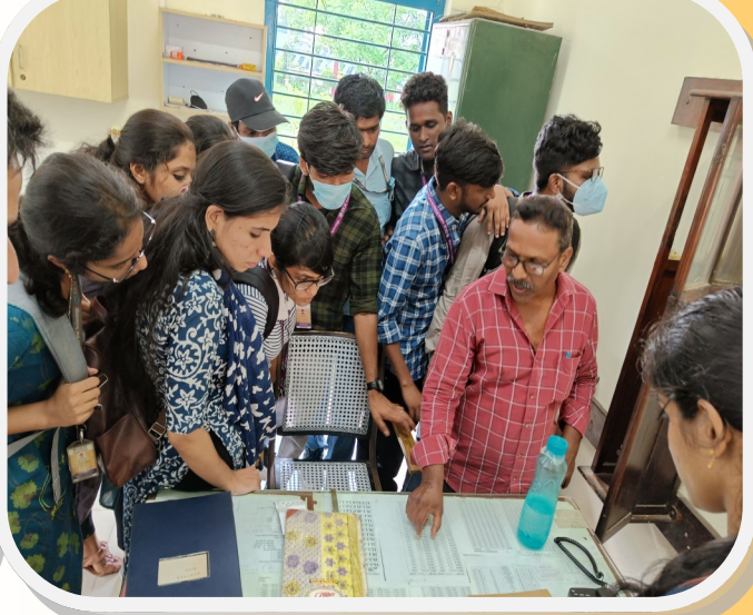
Demonstration at Pilot Balloon Observatory