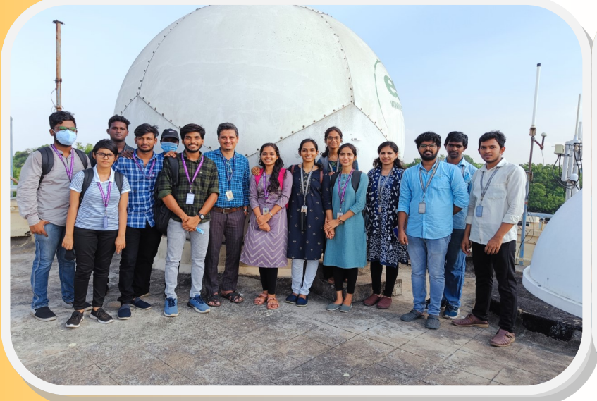
Students' visit to IMD, Chennai—weather Radar